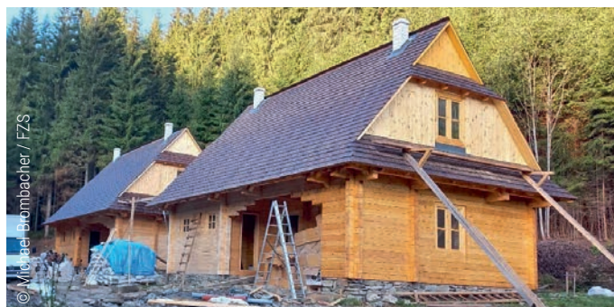
New high quality and ecological ranger houses constructed in accordance with traditional architectural practices were built in Ukraine's Verkhovynskiy National Nature Park, near the Romanian border. A second building functions as a guesthouse for tourists.

Ranger houses, administrative buildings, and museums and information centers of protected areas in the Ukrainian Carpathians are mostly housed in aging buildings that lack insulation, have poor energy efficiency, and may have other major issues such as leaking roofs, which endanger the buildings and the people working and living in them. FZS undertook a massive overhaul of key buildings in the Carpathians, including the construction of new ranger houses that adhere to local ecological and traditional styles, as well as new guest-houses that offer places to stay for people seeking a rest from the war as tourists. By this, parks can also generate income.