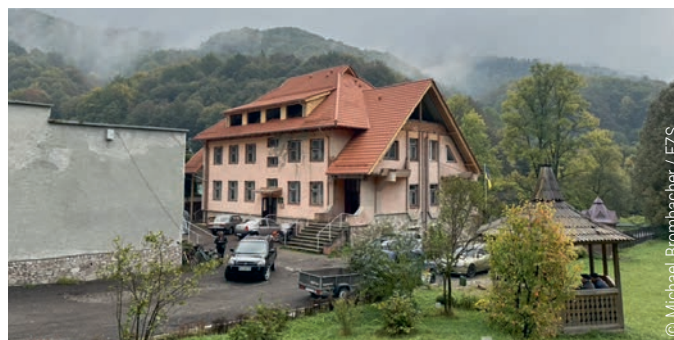
The main administrative building in the Carpathian Biosphere Reserve is currently being renovated. It had a leaking roof which was repaired and replaced.