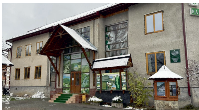
The administrative building of the Carpathian National Nature Park in the city of Yaremche has been renovated. New energy saving and wooden windows have been installed and the outer walls have been insulated. The renovation has significantly reduced the national nature park's energy costs. Currently the heating pipes and the radiators are being modernised and the office rooms renovated.