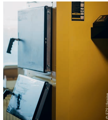
The new boiler installed in Hutsulshchyna National Park after the old one suffered catastrophic failure at the onset of winter.

Operational costs encompass not only the predictable and routine needs of protected areas. Therefore, FZS also provides financial support for urgent and critical requirements. One example in winter 2023 was the unexpected failure of a heating system in the administrative building of the Hutsulshchyna National Nature Park. The wood boiler and associated heating system components were replaced just before the onset of cold weather, enabling 54 staff members to continue their essential day-to-day work.