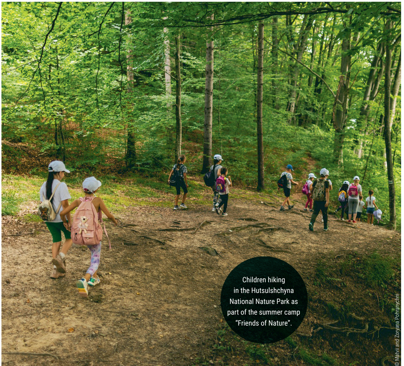
Children hiking in the Hutsulshchyna National Nature Park as part of the summer camp “Friends of Nature”.

In Summer 2023, staff of the Hutsulshchyna National Nature Park hosted a three-day nature camp called “Friends of Nature”. This was the second year in a row that FZS has supported the event, which allows children to visit different parts of the national park, and to study and explore the environment through challenges, creative tasks, and sports activities. Young visitors also got acquainted with the park’s nature trail and learned about local flora and fauna, with particular emphasis placed on the importance of nature conservation and nature-friendly behaviour. The camp also provided an opportunity for children to take a break from the daily challenges and traumas of living in war time in Ukraine. FZS’s operational cost support to the park covered the transport, food and materials needed to make the event possible.