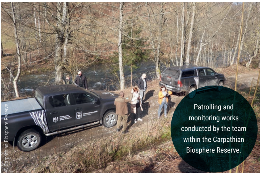
Patrolling and monitoring works conducted by the team within the Carpathian Biosphere Reserve.

Provision of fuel constitutes one of the main recurrent expenses covered by FZS for protected areas in the Ukrainian Carpathians. During 2023, parks and reserves received operational support of nearly 38,000 liters of fuel, enabling staff to carry out essential field-based activities, including routine patrols, environmental monitoring, eco-education activities, and the maintenance of infrastructure. This support is critical in enabling specialists in protected areas to carry out daily conservation work and specific on-site activities.